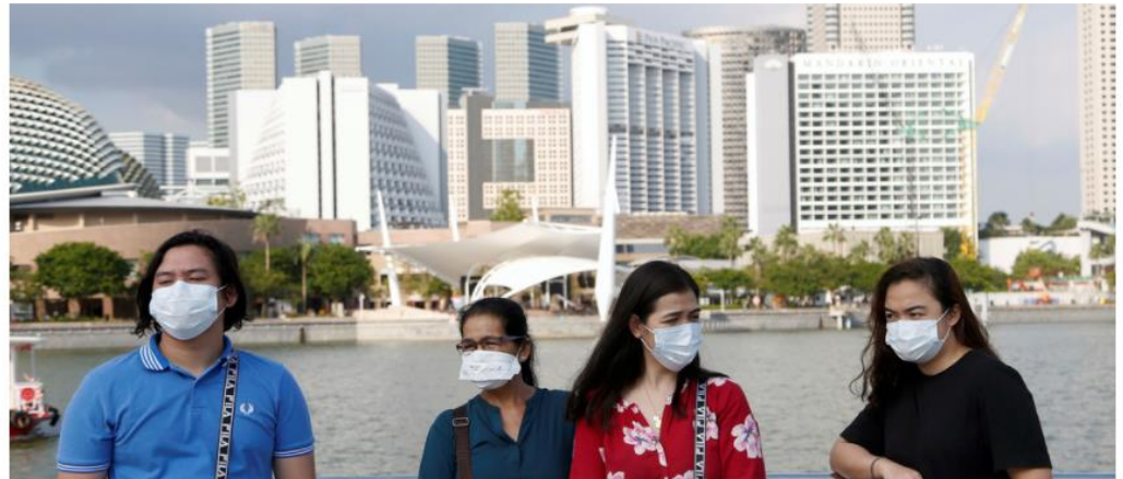
Singapore has done well to contain the virus, with only 96 cases reported.