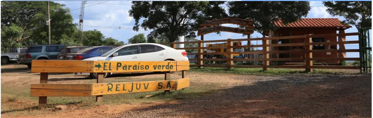
📷 The entrance to El Paraíso Verde, 12km from the town of Caazapá.

A group of German, Austrian and Swiss immigrants has implanted an ideologically driven settlement in one of the country's poorest regions